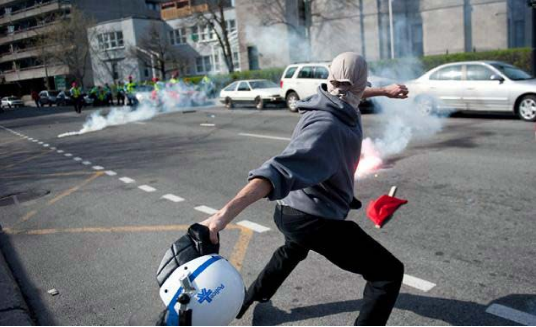
May 1, 2011 in Montréal.

off. It turned out that it was more effective for the government to organize their own tightly-regulated May Day festivities than to simply attempt to crush the demonstrations by brute force. It's instructive to take a close look at their strategy.